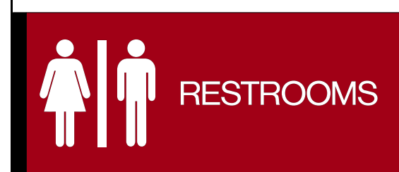
S.12 6" x 14"