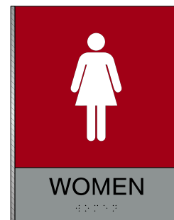
S.9 8" x 6"