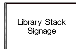
S.3 4" x 6"