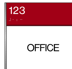
S.6 6" x 6"