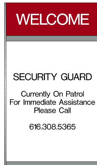
S.21 15" x 8-1/2"