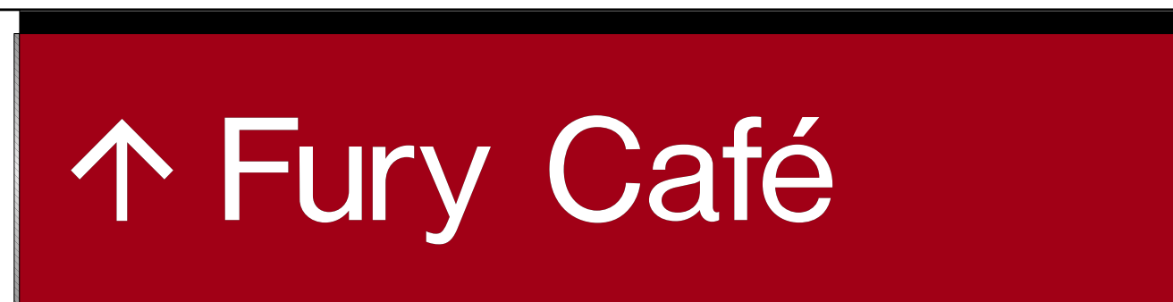
S.16 8-1/2" x 34"