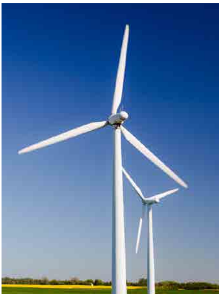
352 THATCH LITE