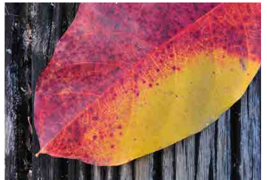
356 DRIFT BLUE