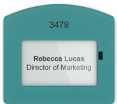
EZID.LL.A ADA Large Landscape Enhanced Arch Screen Size: 4"h x 6.5"w Frame Size: 8.5"h x 9.38"w

Add one of five shapes to any EZ ID™ product. Specify Applied ADA-compliant copy or leave blank.