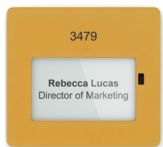
EZID.LL.Q ADA Large Landscape Enhanced Quad Screen Size: 4"h x 6.5"w Frame Size: 8.5"h x 9.38"w