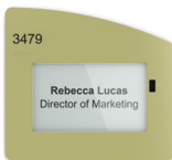
EZID.LL.C ADA Large Landscape Enhanced Curve Screen Size: 4"h x 6.5"w Frame Size: 8.5"h x 9.38"w