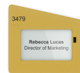
EZID.LL.D ADA Large Landscape Enhanced Diagonal Screen Size: 4"h x 6.5"w Frame Size: 8.5"h x 9.38"w