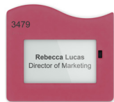
EZID.LL.W ADA Large Landscape Enhanced Wave Screen Size: 4"h x 6.5"w Frame Size: 8.5"h x 9.38"w