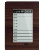
EZID.LP Large Portrait Screen Size: 6.5"h x 4"w Frame Size: 9.38"h x 7"w